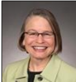
Mariannette Miller-Meeks (R-Incumbent) 49.93%

*As of distribution of this summary document, this congressional district has yet to be called.