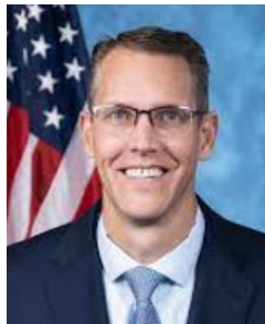
Randy Feenstra (R-Incumbent) 67.08%