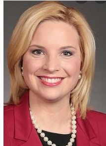
Ashley Hinson (R-Incumbent) 57.03%