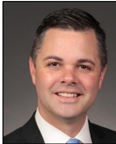
Zach Nunn (R-Incumbent) 51.78%